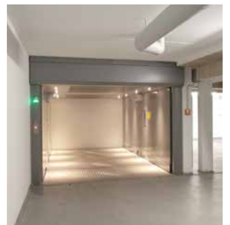
Rolling gate and traffic lights in a discreet appearance in the lower position.