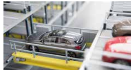
Opened in 2018 BLOX, COPENHAGEN, DENMARK Fully automated car park system with 350 parking spaces